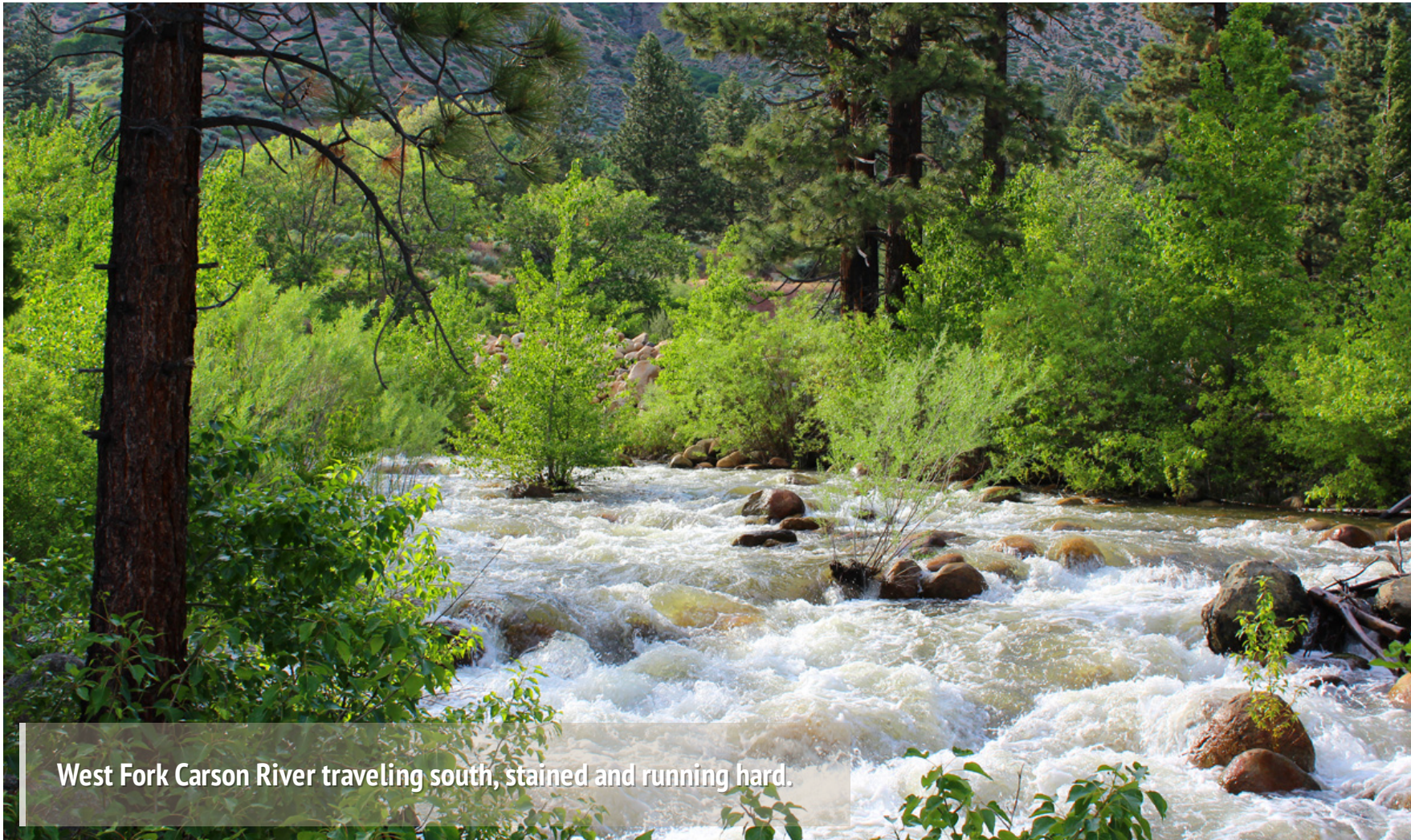
West Fork Carson River traveling south, stained and running hard.