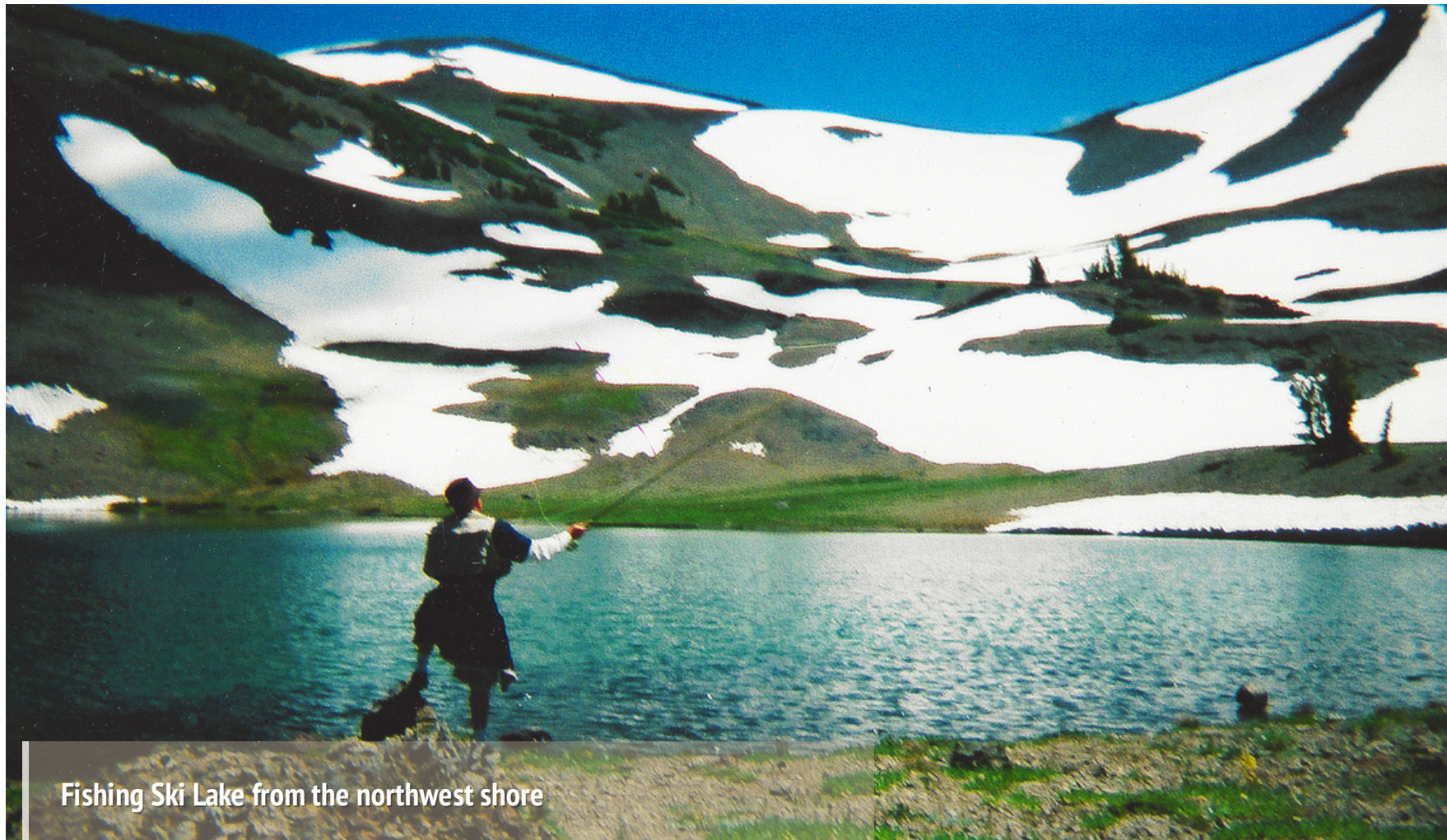
Fishing Ski Lake from the northwest shore