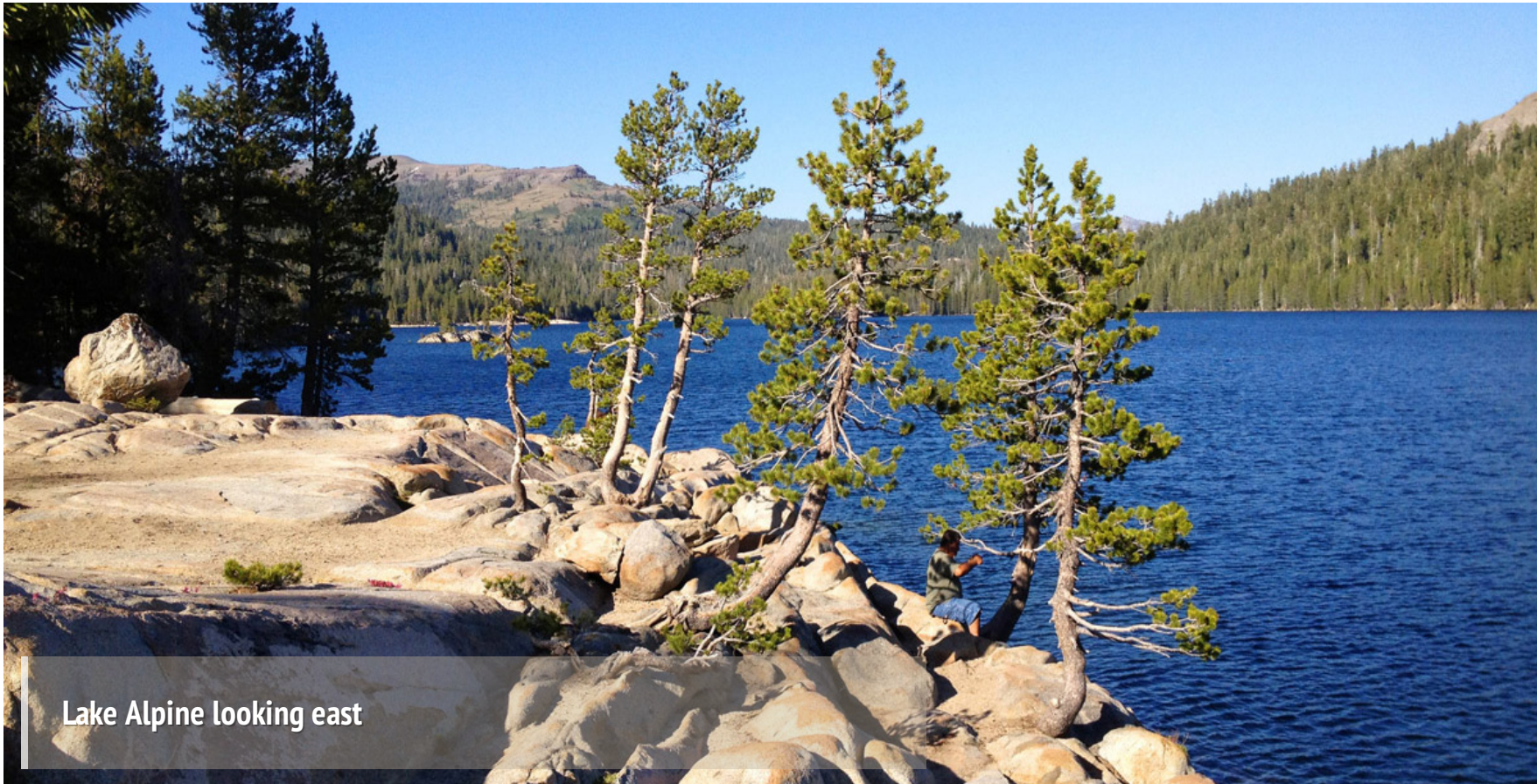
Lake Alpine looking east