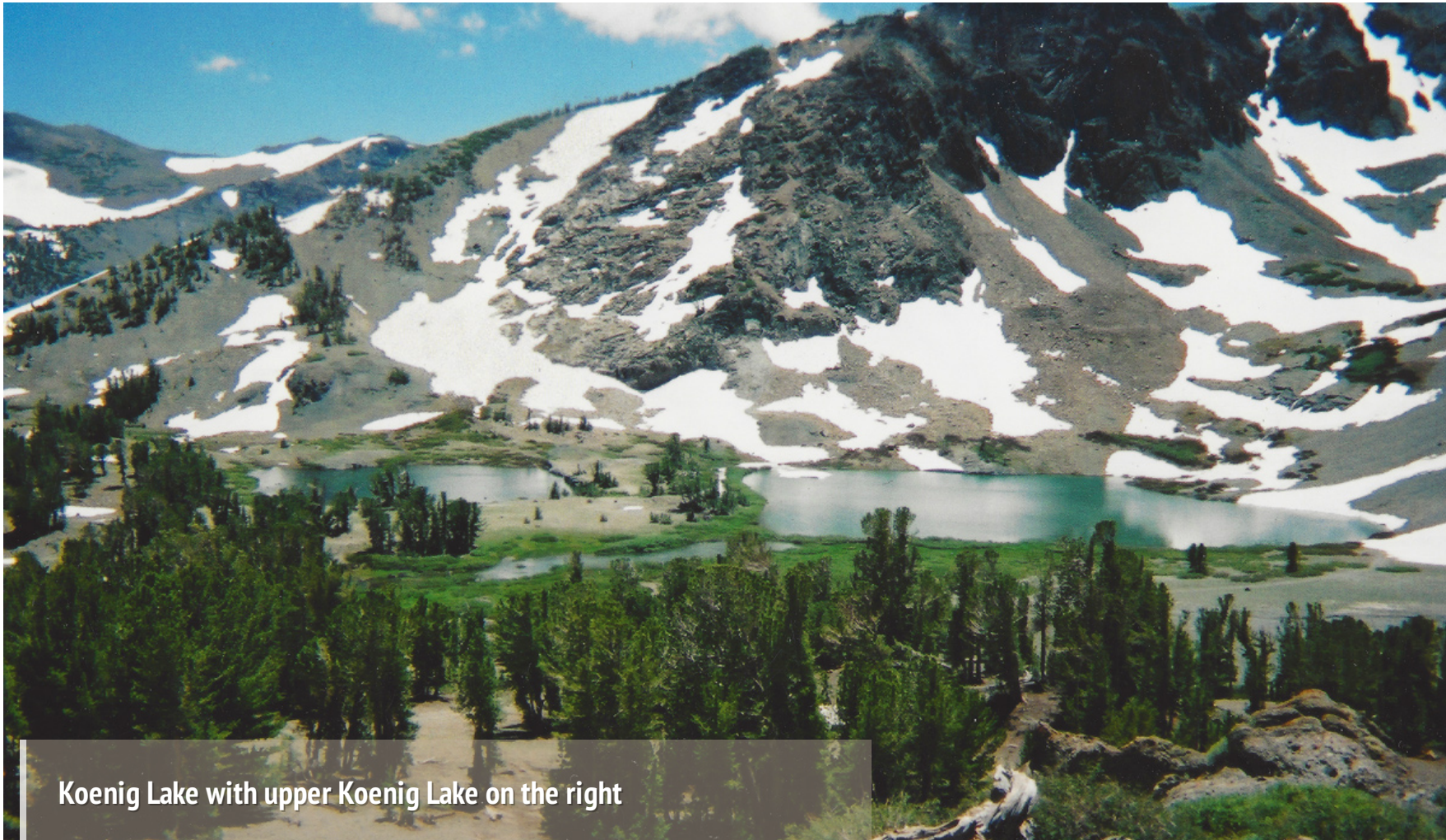
Koenig Lake with upper Koenig Lake on the right