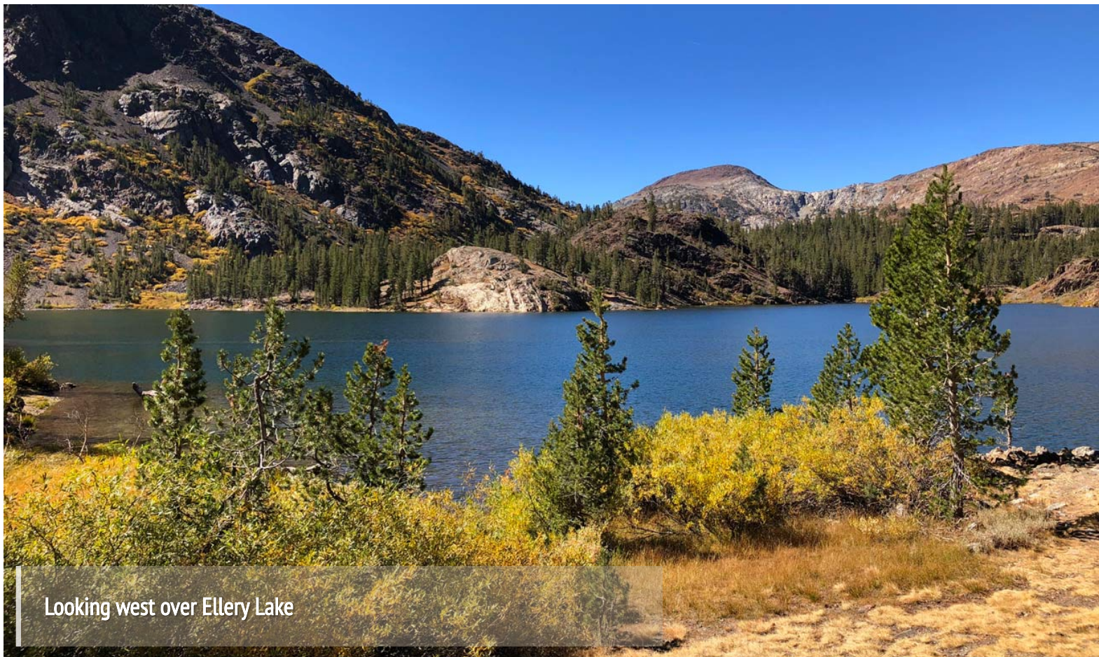
Looking west over Ellery Lake

HOME ABOUT LAKES STREAMS CONTACT SUBMIT REPORT